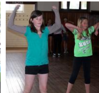
Chloe and Holly do Hip Hop!