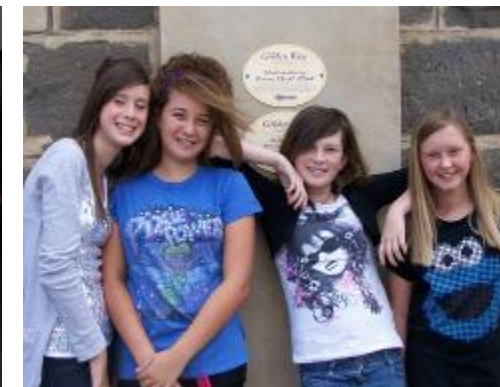
Romsey's Glamour girls!