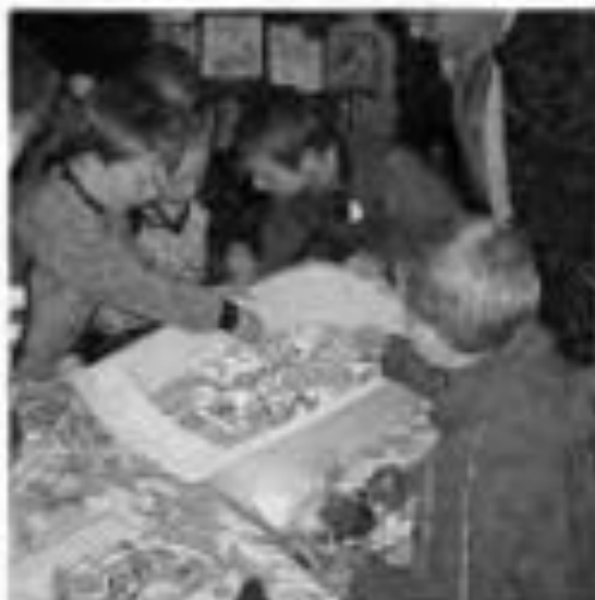
Above: Eager young scientists at Family Science Night.

Following the in-school Tournament of the Minds competition earlier this year, the school has entered two teams in the Regional Tournament of the Minds event in Bendigo. Tournament of the Minds focuses on students responding to a challenge and coming up with creative and original solutions. Cooperation, teamwork and leadership are essential skills to be developed and enhanced through involvement in this competition. Both the "Social Science" and "Language and Literature" teams recently presented their solutions to the whole school at our Monday assembly.