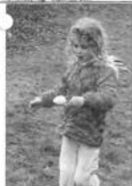
Olympics— Romsey Kindergarten style!