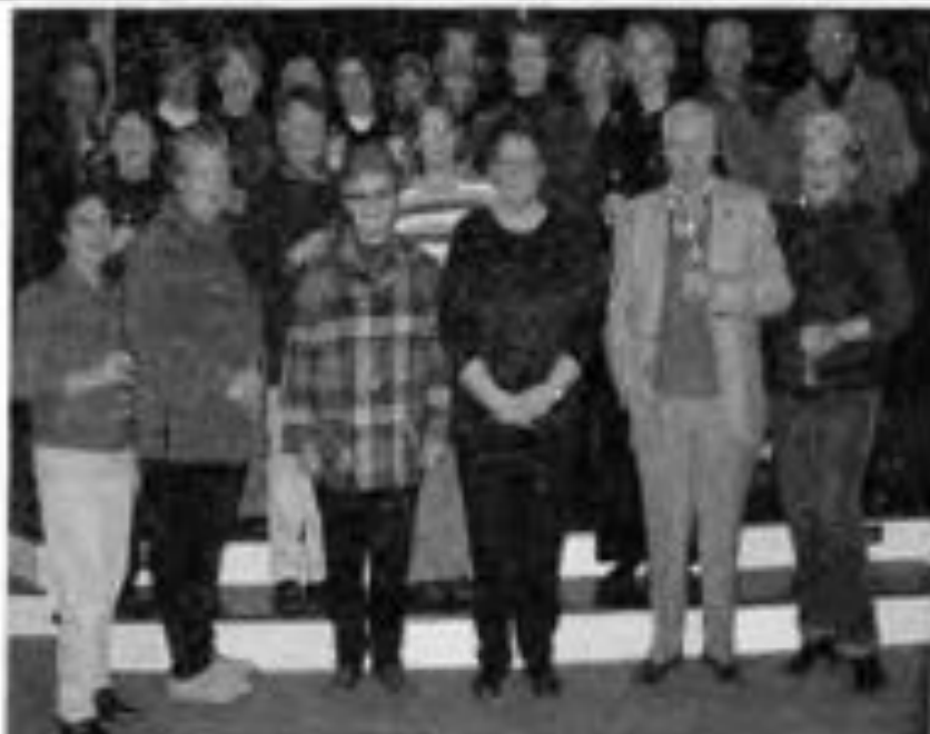
* Romsey Rag celebrates its 20th birthday! Please turn to page 14 for a full report.