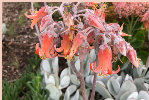
The apricot flowers of Cotyledon orbiculata .

I've been cutting off the spent flower stems from some of my succulents – Cotyledon orbiculata and Echeveria imbricata mainly.