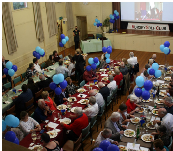
The Romsey Golf Club Centennial Dinner.