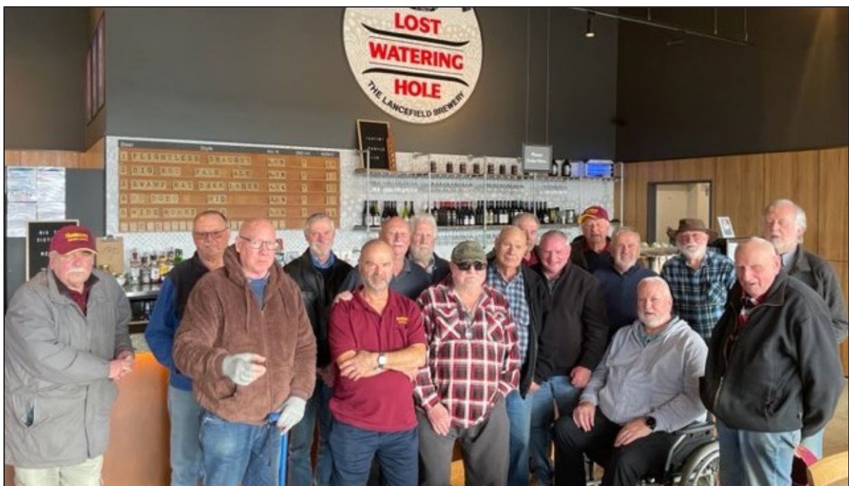
Photo Caption. A happy lunch at the Lost Watering Watering Hole in Lancefield.