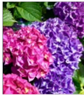
Our annual hydrangea pruning cuttings which are on sale for just $2.00 a bunch of 10 cuttings.

Please note that owing to regulations we cannot accept electrical goods, prams, baby cots, furniture or mattresses. Your ongoing support and donations is much valued and appreciated.