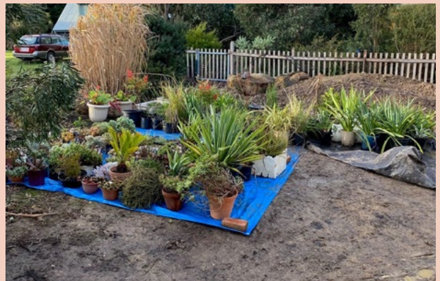
My plants in Transit.

I am already enjoying gazing out the bedroom window at the beautiful gum tree in my neighbour's back yard. I can also see the amazing growth on my green mallee - Eucalyptus viridis . I coppiced it back in May 2020 and currently the new growth is shrub-like; but eventually it will attain the typical mallee form with long thin trunks topped with mops of foliage. A bit like a Dr Seuss tree!