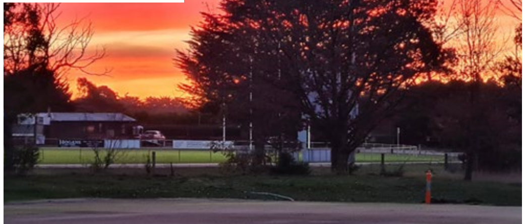
Winter's sunset over the new green.

Work Shed: The proposed site for the work shed has been approved and it is now up to the contracted builders to finalise the plans for shed before any works can proceed. The club will work with the shire to help keep costs as low as possible.