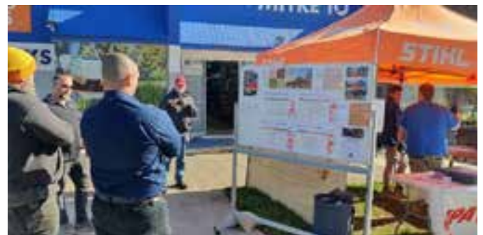
LEFT: THE ACTION PLAN ON DISPLAY AT THE RESIDENTS' EXPO RIGHT: Community Sausage Sizzle at Mitre 10.