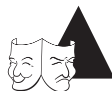
The Mount Players

Bookings can be made online from our website www.themountplayers.com or if you need assistance or have any queries, please call 5426 1892.