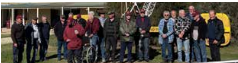
THE RMS Team on Crane Training International Excursion.

Shed extension: We have a small Building Fund, but need a significant financial grant and Shire approval to proceed.