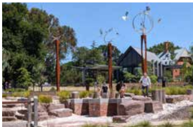
PICTURED: Romsey Ecotherapy Park by ACLA Consultants.

Victoria's regions recognised in awarded landscapes The Australian Institute of Landscape Architects (AILA) has announced the winners of the 2024 Vic State Awards at an event held in Melbourne. The jury honoured 25 winners from a total of 68 entries across 14 categories, including three Regional Achievement Award winners. Victoria's regions recognised in awarded landscapes The Australian Institute of Landscape Architects (AILA) has announced the winners of the 2024 Vic State Awards at an event held in Melbourne.