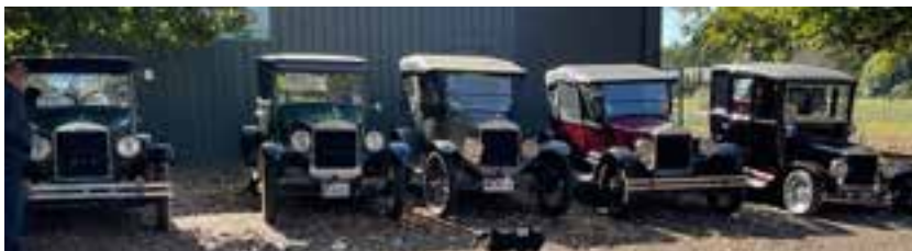
MODEL T Ford Club visit to Shed.

OUR FACEBOOK PAGE IS: Romsey Mens Shed Inc. We have a GO FUND ME for the T model project.