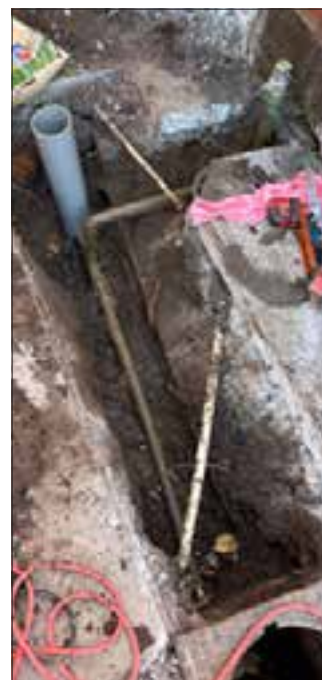
LEAK repaired & bypass in place.